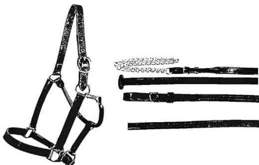
Western Stock Halter approved equipment

will be used under the chin; chains over the nose or lip chains are prohibited.